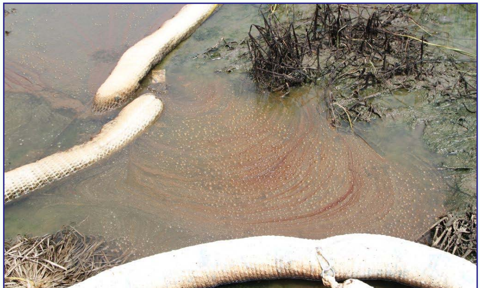
Bubbling oil seeps past booms onto Louisiana coastal islands in August 2010 (photo of Timbalier Island's dying marsh plants).

HOW TO REACH US Mail: Sierra Club Ontario, 24 Mercer St., Toronto, ON M5V 1H3; Telephone: 416-960-9606; Fax: 416-960-0020; E-mail: ontariochapter@sierraclub.ca; Web: http://ontario.sierraclub.ca ; Membership: membership@sierraclub.ca; National Office: 412-1 Nicholas St., Ottawa, ON K1N 7B7; Telephone: 613-241-4611